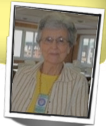
Written by: Frances Mason

Imagine a beautiful, cool, (cold?), Autumn weekend sitting around a campfire with the moon shining through the trees. The leaves are colorful even at night from the light of the fire and the moon, but during the day they are brilliant from the sun; fall foliage at its peak. Add to this a pot of homemade soup simmering on a nearby burner and special breads and desserts waiting on the table. To top it off there are special friends sitting in a circle, sharing stories and jokes and of course laughter as the tall tales get stretched and broadened. Children playing close by and their shrieks of joy surround us. Does this sound like a perfect weekend? This one was about as close as it gets.