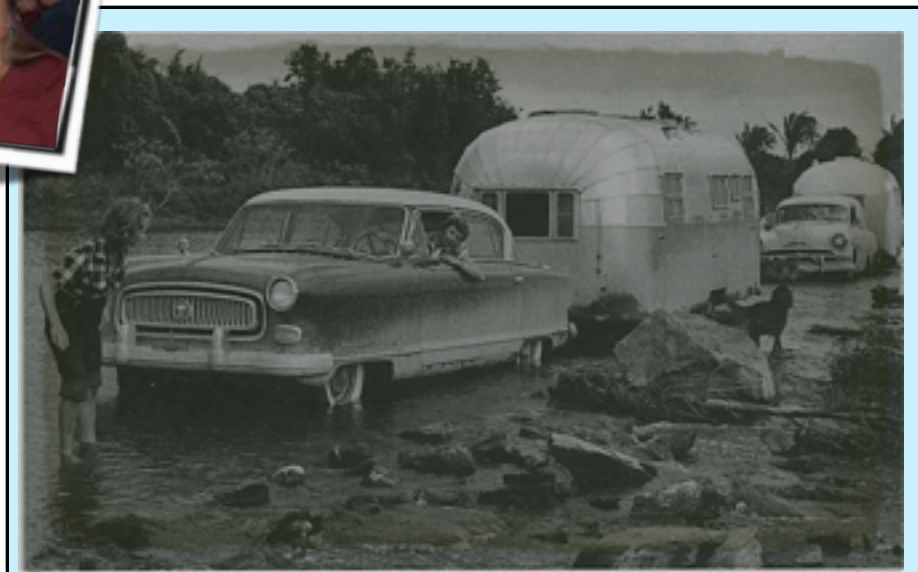
The next time you think you have the Airstream on a bad road...remember this....Mexico 1957.