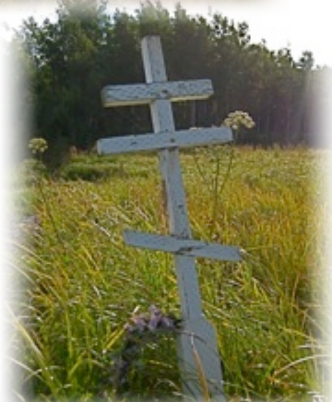
Russian Orthodox Cross along a trail in Kenai, Alaska