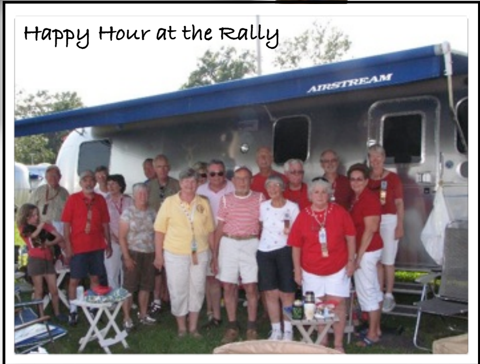
Happy Hour at the Rally