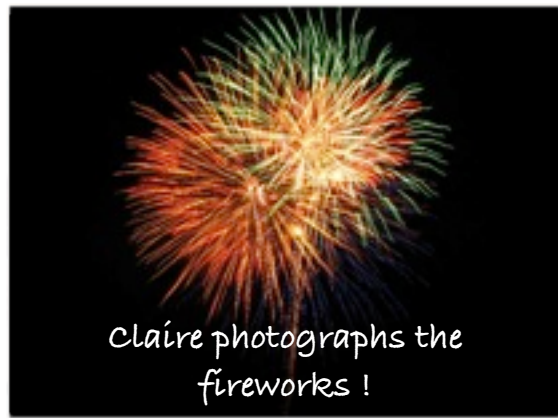
Claire photographs the fireworks !